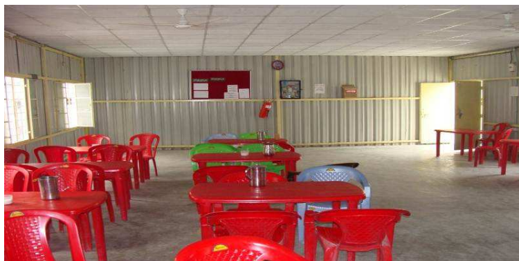
Community Kitchen for staff

Forest Dept. monitors the trespasses by installing a check post at Pamphok Village.