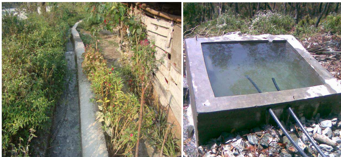
Constructed Irrigation channel & water supply tank for villagers

C) World Environment Day Celebration- LTHPPL had celebrated WED 2012 in their plant area on the occasion of WED 2012 we had organized several Environment awareness activities such as plantation, Quiz, Rally, etc. among our employees as well as among the local school children.