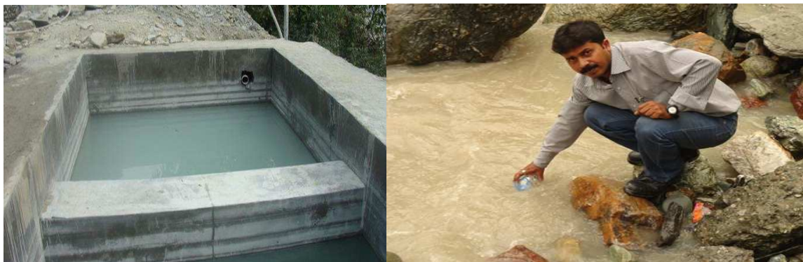
Settling Tank & Sampling for Water Monitoring