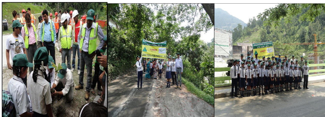
Glimpse of the WED-2012 celebration at Site

C) World Environment Day Celebration- LTHPPL had celebrated WED 2012 in their plant area on the occasion of WED 2012 we had organized several Environment awareness activities such as plantation, Quiz, Rally, etc. among our employees as well as among the local school children.