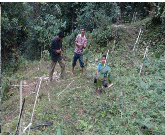
RCC Road Side Protection & Road Side Plantation