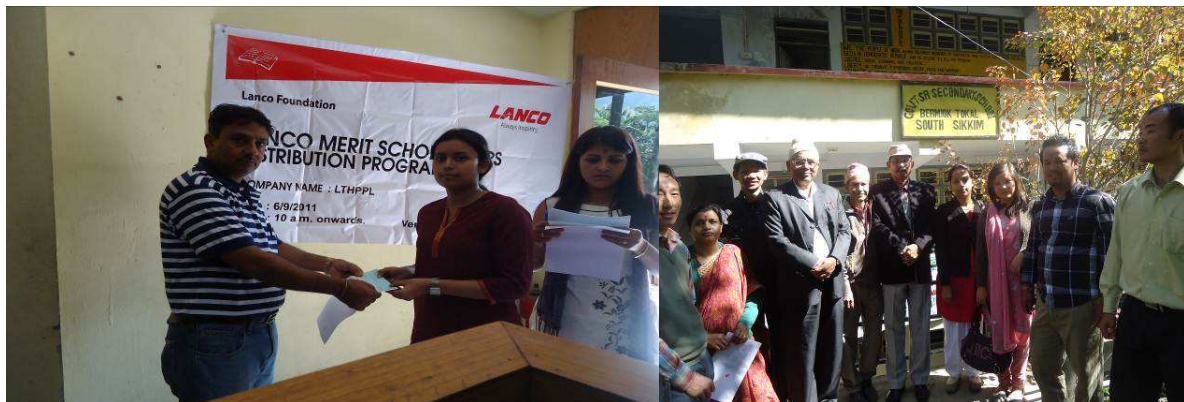
Distribution of Scholarship & School Development Grant for 2011-2012 in the Project area

Given scholarship for 4 MBBS Students & 10 B .Tech Students from State of Sikkim