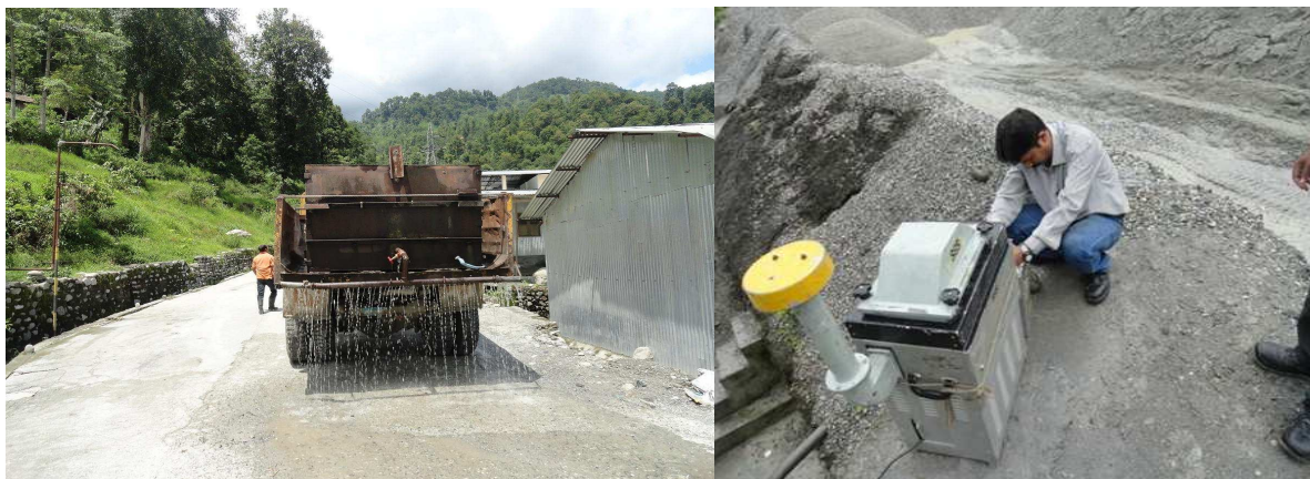
Air Pollution control measures at Site