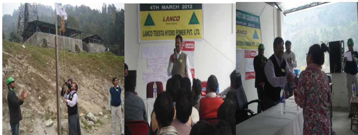
Safety Day Celebrations at Sites