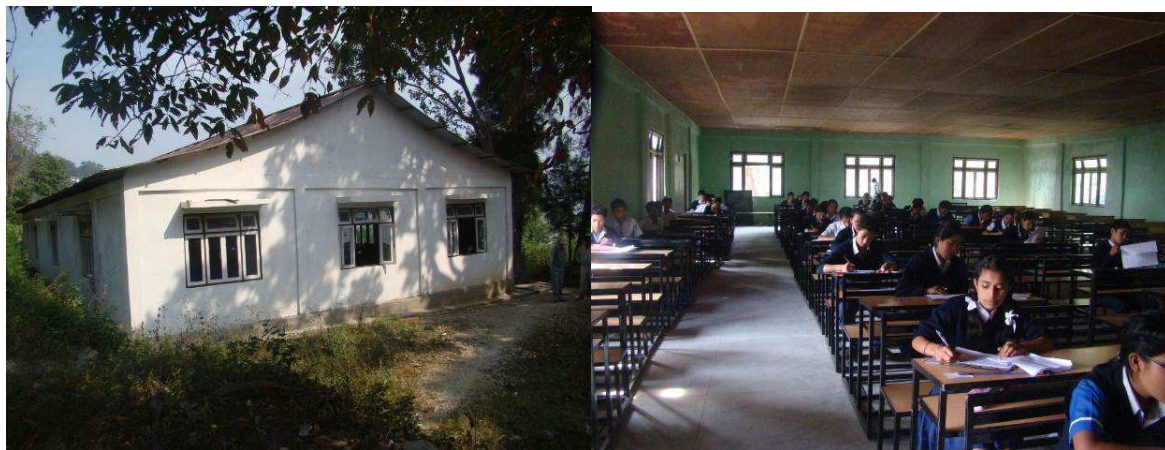
Constructed Community Hall in village Turung