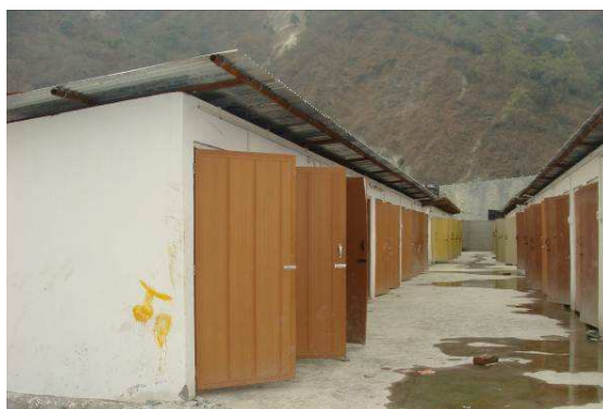
Labour Camp and Community Toilets